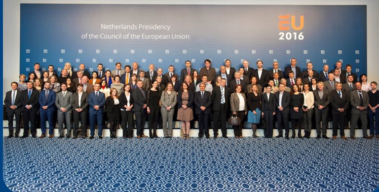
EU Conference Missing Persons: Missing Information Wednesday 25 May 2016, Amsterdam The Netherlands