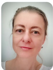
PETRA BINKOVA The Czech Republic Senior Ministerial Councillor – Ministry of the Interior of the Czech Republic, Crime Prevention Department – Trafficking in human beings